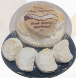
GREEK ALMOND SHORTBREAD Unit Weight: 240G