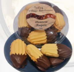
VIENNESE FINGERS Unit Weight: 300G