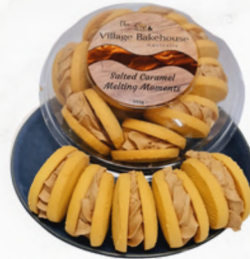
MELTING MOMENTS SALTED CARAMEL Unit Weight: 350G