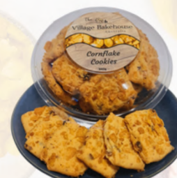
CORNFLAKES Unit Weight: 240G