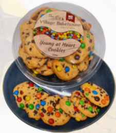
YOUNG AT HEART Unit Weight: 240G