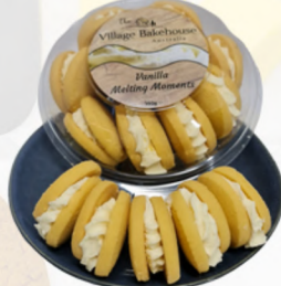
MELTING MOMENTS VANILLA Unit Weight: 350G