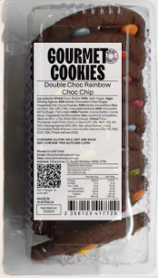
100mm Diameter 60 grams 11 in a pack