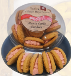
MONTE CARLO Unit Weight: 320G