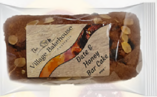
DATE AND HONEY

ALL VARIANTS UNIT WEIGHT: 600G CASE QTY: 6 STORAGE: FREEZER