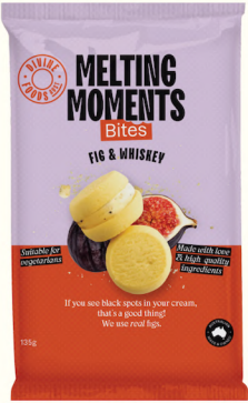
Lemon Myrtle and Plum Lemon Myrtle and Native Peppermint Fig and Whiskey