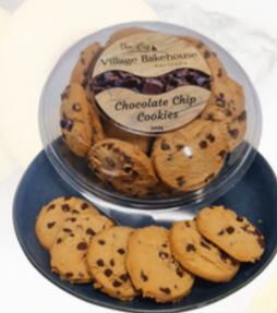
CHOC CHIP Unit Weight: 240G