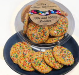
100'S AND 1000'S Unit Weight: 240G