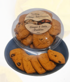
GINGER AND DATE Unit Weight: 240G