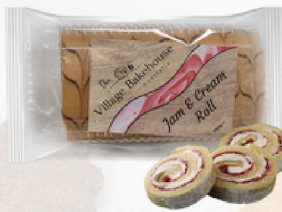
JAM AND CREAM