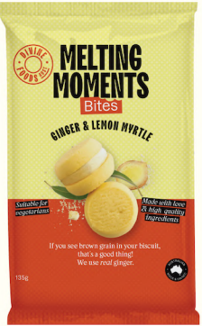
Almond and Macadamia Ginger and Lemon Myrtle