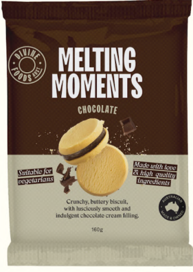
Vanilla Salted Caramel Passionfruit Chocolate