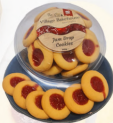
JAM DROPS Unit Weight: 240G