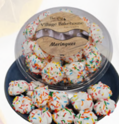
MERINGUES Unit Weight: 80G