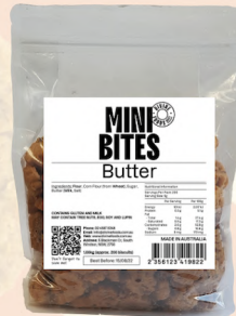
30mm Diameter 5 gram each cookie ~200 in each pack 1KG pack