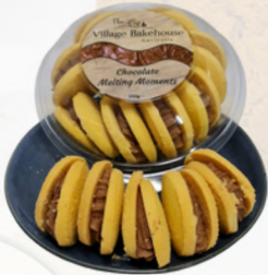
MELTING MOMENTS CHOCOLATE Unit Weight: 350G