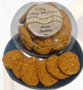
ANZAC Unit Weight: 240G