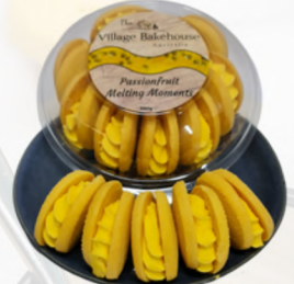
MELTING MOMENTS PASSIONFRUIT Unit Weight: 350G