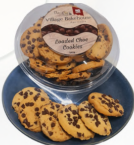
LOADED CHOC Unit Weight: 240G